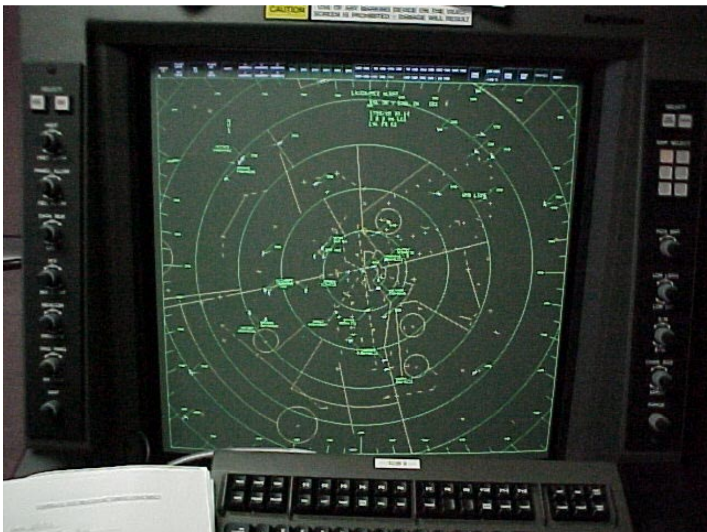
Figure 2: STARS Display with Air Traffic