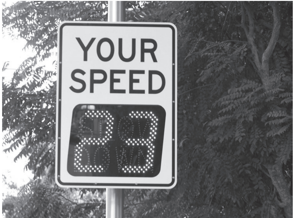
Figure 2: Picture of Speed Feedback Sign