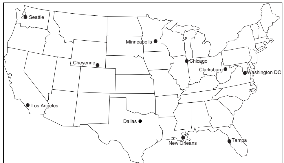
Figure 2: VA Medical Centers Visited

At these locations, we visited in total 71 clinics—17 primary care clinics and 54 clinics in five specialty areas: dermatology, gastroenterology, eye care (ophthalmology and optometry), orthopedics, and urology—within 10 VA medical centers. We selected these specialties, using data from VA's national VISTA database for April, May and June 2000, because the data showed that these areas had some of the highest waiting times for scheduled outpatient clinic appointments compared to other VA specialty