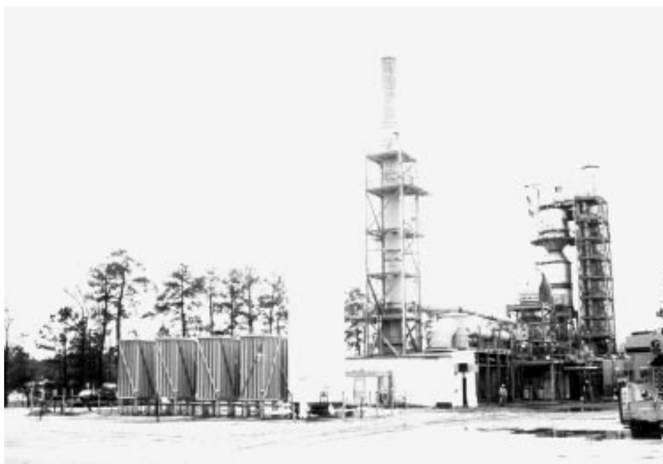
Figure I.2: Incinerator at Bayou Bontouca

In addition to 15 automatic waste feed cutoff parameters to prevent the incinerator from operating outside the regulatory limits, the incinerator has an emergency stack venting system that further treats the gases from the kiln if the incinerator is totally shut down. In case of a power outage or another event that would cause the major functions of the incinerator to fail, this emergency system draws the kiln gases 9 into an emergency stack where a flame further destroys contaminants. According to an incineration