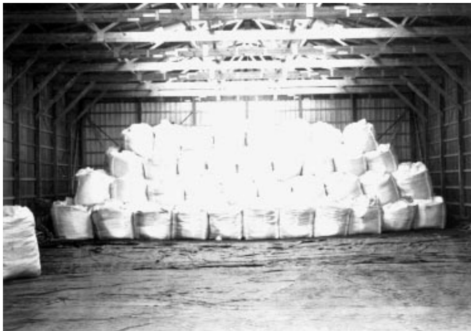
Figure I.3: Dioxin Contaminated Soil From Times Beach

The Times Beach site is unusual because EPA obtained a RCRA permit to operate the incinerator. A permit is generally not required at Superfund sites, and the process of obtaining it resulted in some delays in beginning operations. However, EPA regional officials obtained the permit to provide nearby residents with additional assurance that the incinerator would operate safely and would be removed after the project was completed, rather than being kept in place to burn contaminated material from other sites. As required by the permit, the Times Beach incinerator has 17 automatic waste feed cutoffs. In addition, the incinerator includes the same emergency system that is used at Bayou Bonfouca.