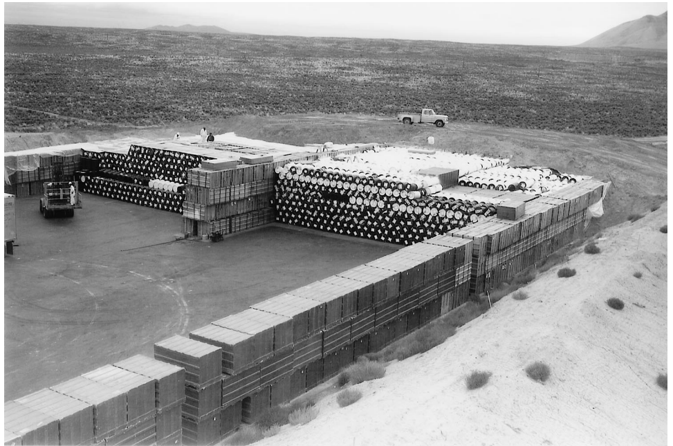
Figure 2: Mixed Waste Boxes and Drums Being Placed on an Asphalt Pad at INEEL