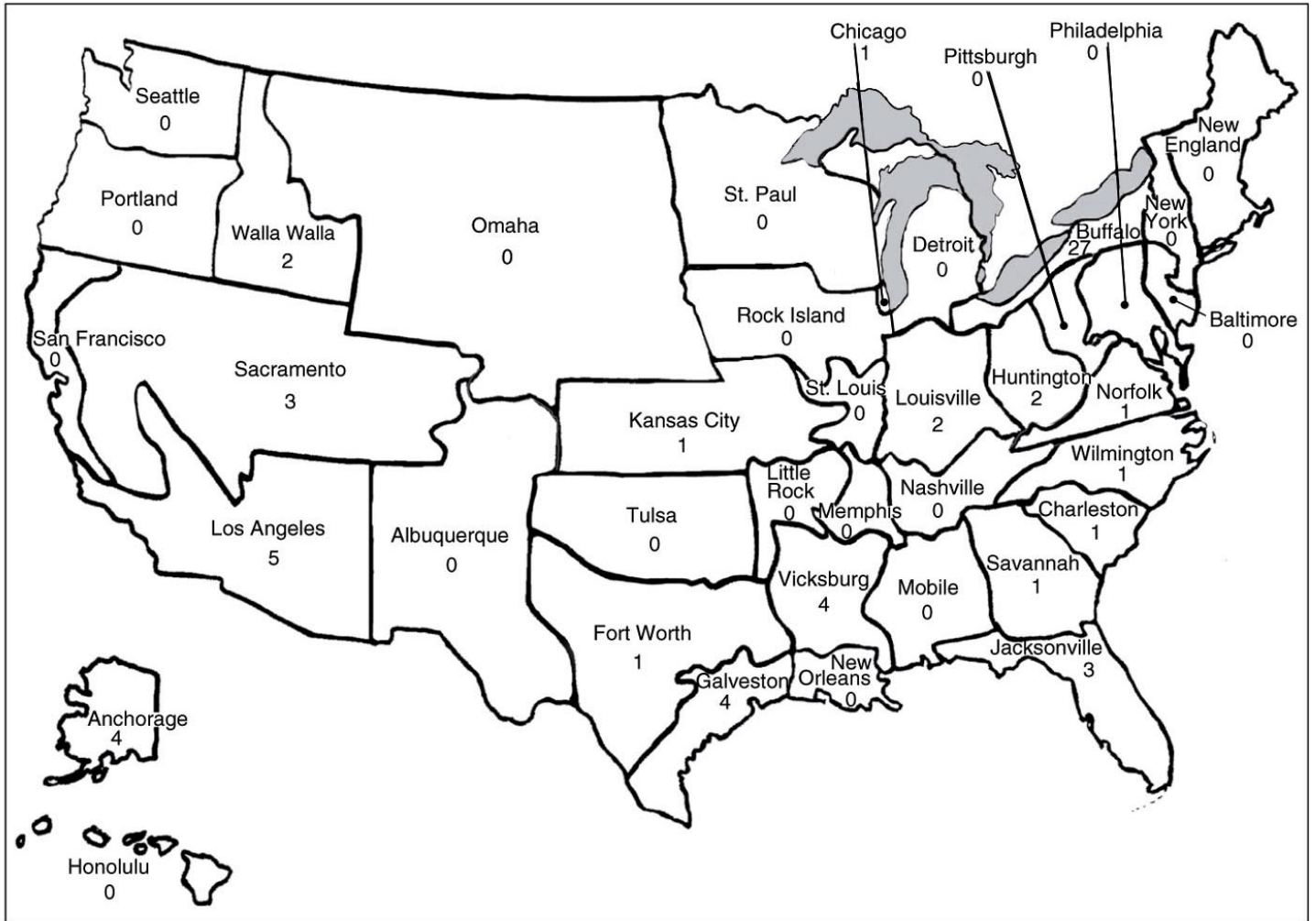
Figure 2: Number of In-Lieu-Fee Arrangements by Corps District, as of September 30, 2000