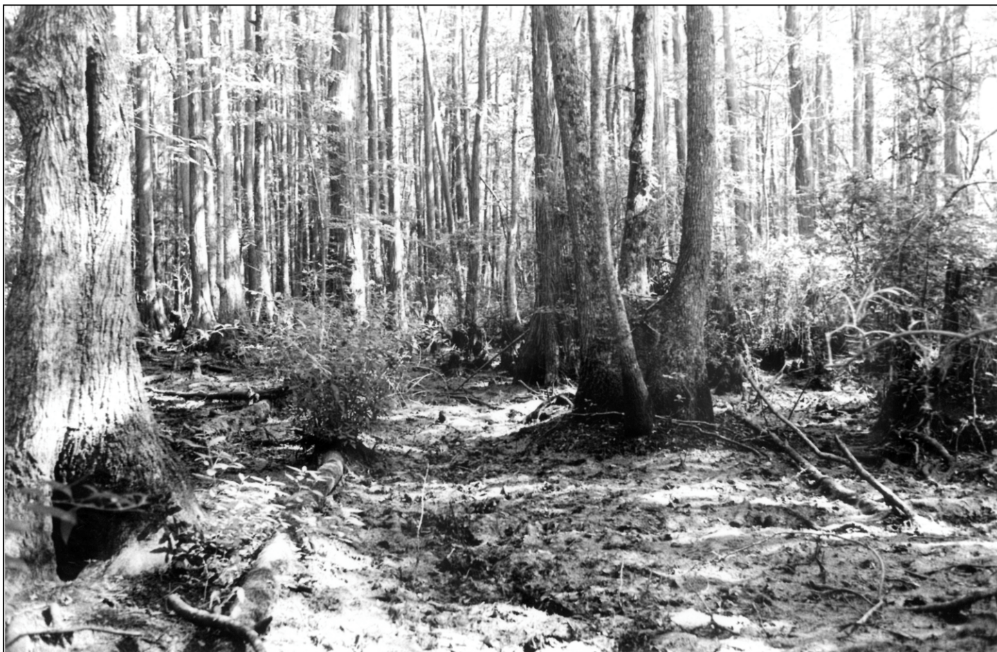
Figure 1: Bottomland Hardwood Wetland in Georgia