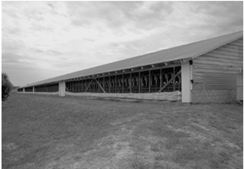
Figure 2: Covered Operation