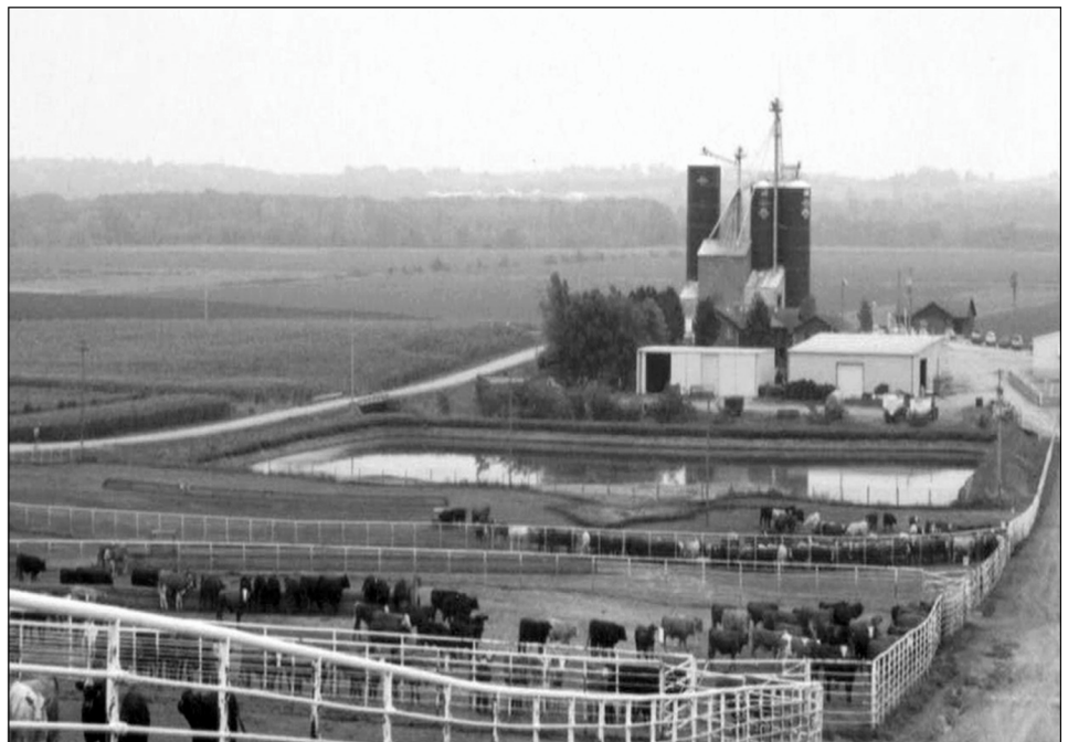
Figure 1: Uncovered Operation

The two states that lead the nation in swine production illustrate how programs can meet some EPA permit requirements but not others. For example, while Iowa's permits for uncovered operations (see fig. 1) meet all program requirements, its permits for covered operations (see fig. 2) do not. Contrary to EPA requirements that permits are renewed every 5 years, Iowa issues these permits for indefinite periods of time. While North Carolina issues permits to both covered and uncovered animal feeding operations, these permits do not include all EPA requirements, such as provisions for public participation or allowing for EPA enforcement of the state permit.