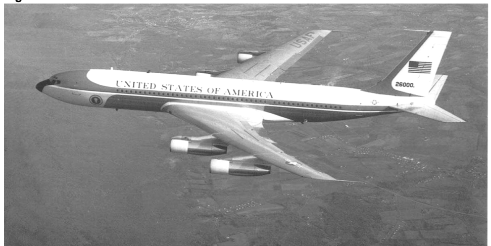
Figure 2: C-137 Aircraft

The C-137, first placed into service in the early 1960s, was originally used to transport the President (see fig. 2). In 1990, the VC-25 replaced it, but the C-137 is still sometimes used by the Vice President, First Lady, and other high ranking officials. Only one remains in the Air Force's inventory.