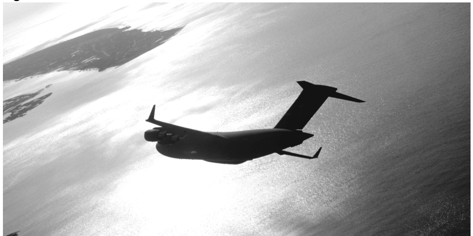
Figure 9: C-17 Aircraft

The C-17 (see fig. 9) is the newest cargo aircraft to enter the airlift force. The C-17 can carry 160,000 pounds of cargo for 2,400 nautical miles without refueling. The C-17 will become the primary military airlift aircraft once it replaces the C-141s.