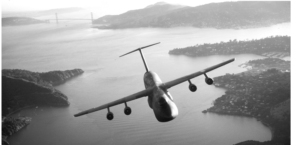
Figure 7: C-5 Aircraft

The C-5 is one of the largest aircraft in the world (see fig. 7). It can carry 291,000 pounds of cargo.