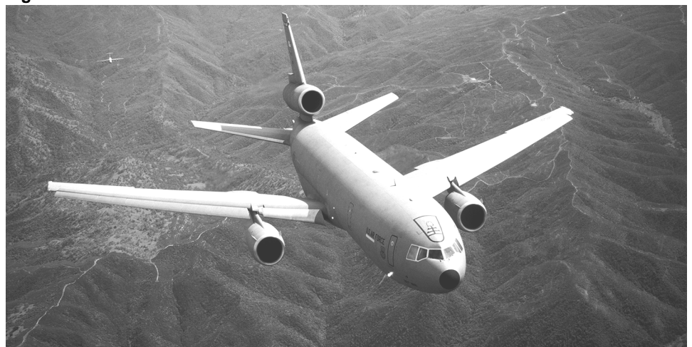
Figure 12: KC-10 Aircraft

The KC-10 performs tanker and cargo missions (see fig. 12). The KC-10 has a fuel capacity of 365,000 pounds, or it can transport up to 75 people and nearly 170,000 pounds of cargo a distance of about 4,400 miles without refueling.