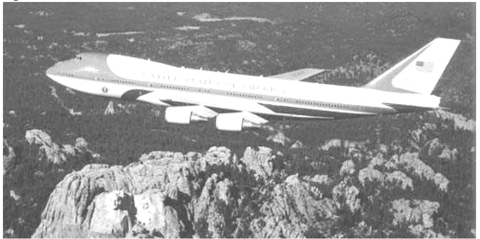
Figure 1: VC-25

The VC-25 provides passenger transport for the President (see fig. 1). The Air Force has two of these aircraft. Other than the number of passengers carried, the principal differences between the VC-25 and the standard Boeing 747 are the electronic and communications equipment, interior configurations and furnishings, and the capability for in-flight air refueling.