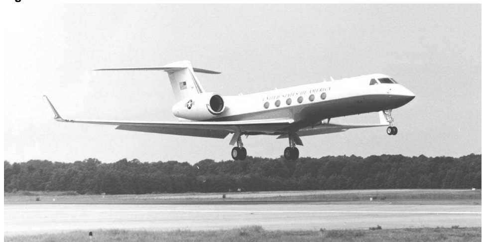
Figure 5: C-37 Aircraft

The C-37 was placed into service in October 1998. The C-37 is the military version of the Gulfstream V (see fig. 5). The C-37 resembles the C-20 but is 13 feet longer and, according to the Air Force, has a more advanced avionics package and greater performance capabilities.