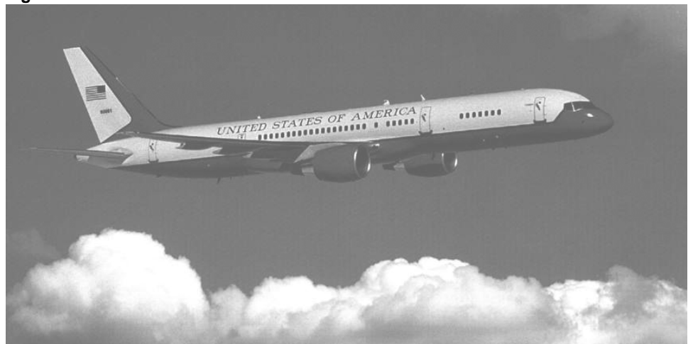
Figure 3: C-32 Aircraft

The C-32 (see fig. 3), placed into service in early 1998, is replacing the C-137. The C-32s, which are modified Boeing 757s, have transported the Vice President, First Lady, and others.