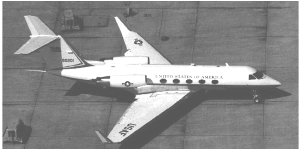
Figure 6: C-20 Aircraft

The C-20 aircraft is a twin engine turbofan aircraft (see fig. 6). It is a modified Gulfstream III.