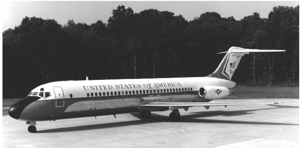
Figure 4: C-9 Aircraft

The C-9 is a modified version of the McDonnell Douglas DC-9 (see fig. 4). It has been used to transport the President, Vice President, First Lady and others.