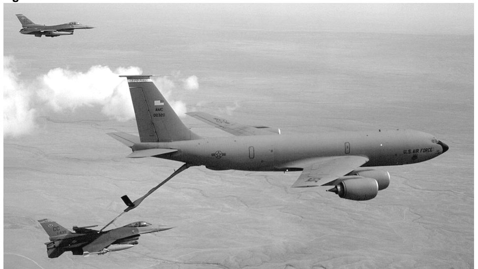
Figure 11: KC-135 Aircraft

The KC-135's principal mission is air refueling (see fig. 11). The KC-135 can carry 150,000 pounds of fuel for 1,500 nautical miles. A cargo deck above the refueling system can hold a mixed load of passengers and cargo.