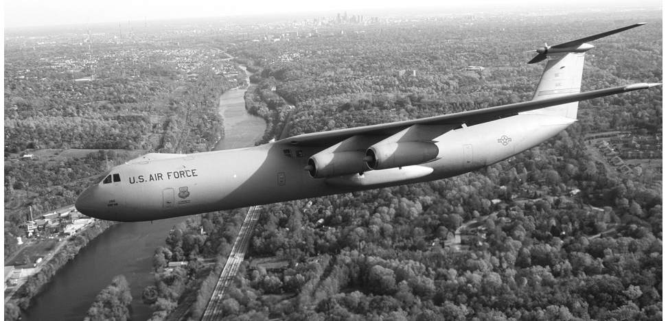
Figure 8: C-141 Aircraft

The C-141 fills many DOD airlift requirements. The modified C-141s can carry 68,000 pounds of cargo for 2,270 nautical miles without refueling (see fig. 8). The C-141 fleet is being replaced by the C-17.