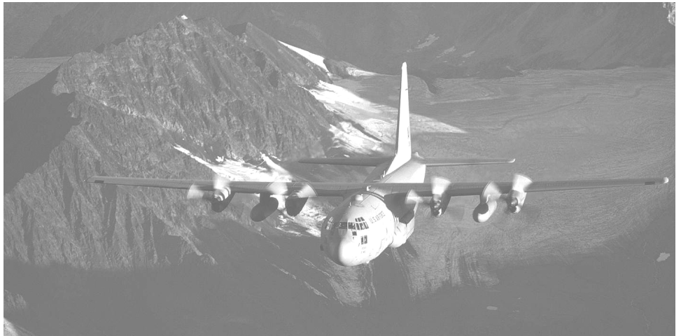
Figure 10: C-130 Aircraft

The C-130 performs the tactical portion of the airlift mission (see fig. 10). It comes in a variety of versions with differing range and payload. In its airlift role, it can carry up to 92 combat troops or 6 pallets of cargo.