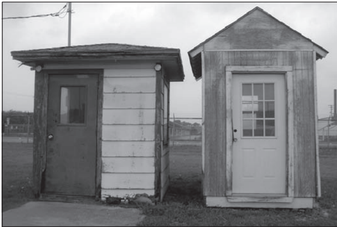
Empty guard house structures