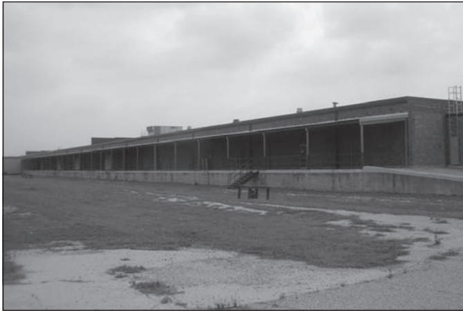
One of four large warehouses