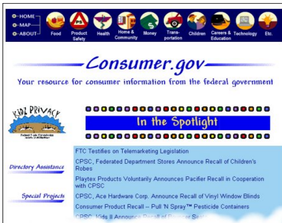
Figure 2: Federal Trade Commission’s www.consumer.gov Home page

The FTC, an independent agency responsible for enforcing antitrust and consumer protection laws, initiated the www.consumer.gov site in 1995 with a budget of $25,000. Today, the site provides links to consumer information on 168 federal web sites. The FTC actively encourages federal web sites to provide appropriate links to www.consumer.gov on their web sites. In a typical month, the site receives 85,000 visits and 130,000 page views by visitors.