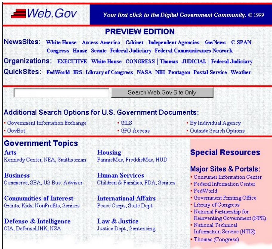
Figure 3: Prototype of GSA’s FirstGov Home page

GSA is developing an Internet gateway called FirstGov , formerly known as WebGov . According to GSA, an early prototype was developed in 1998 and currently a functioning pilot version, shown in figure 3, is maintained on a contractor website.