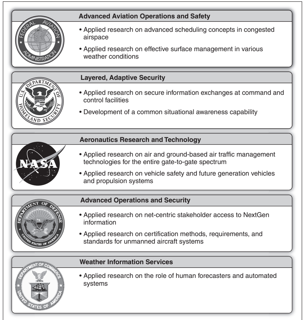
Figure 1: Examples of Partner Agency Responsibilities for NextGen Technology Research and Development

Source: GAO analysis of JPDO information.