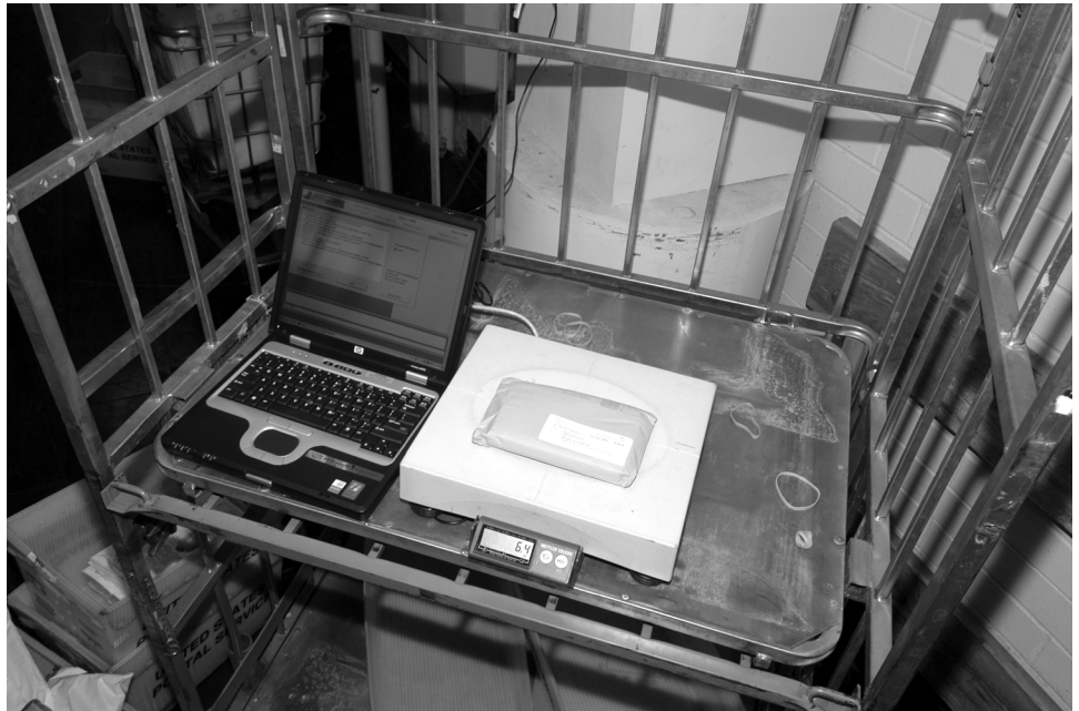
Figure 8: Laptop Computer and Digital Scale Used to Record Ratemaking Data, Including Mail Piece Characteristics