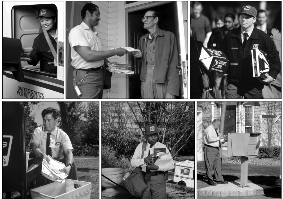
Figure 9: USPS City Carriers Performing Delivery Activities on the Street