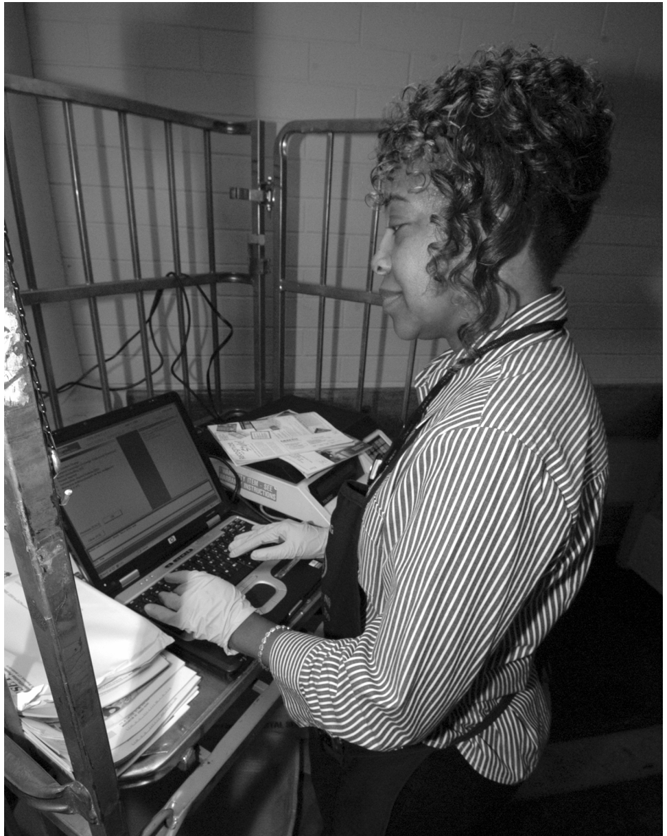
Figure 1: USPS Data Collector Using a Laptop Computer and Digital Scale to Record Ratemaking Data at a Postal Facility