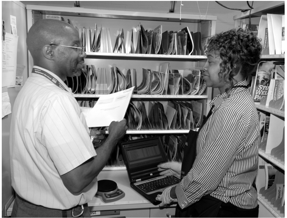
Figure 5: USPS Data Collector Gathering Ratemaking Data from a Letter Carrier Manually Sorting Mail into Pigeonholes for Delivery