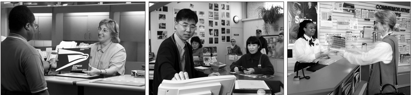
Figure 4: USPS Clerks Performing Retail Activities