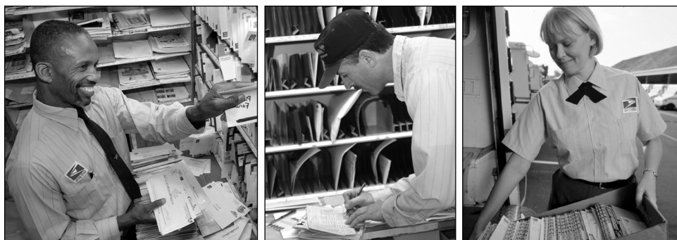
Figure 2: USPS Letter Carrier Activities at Postal Facilities