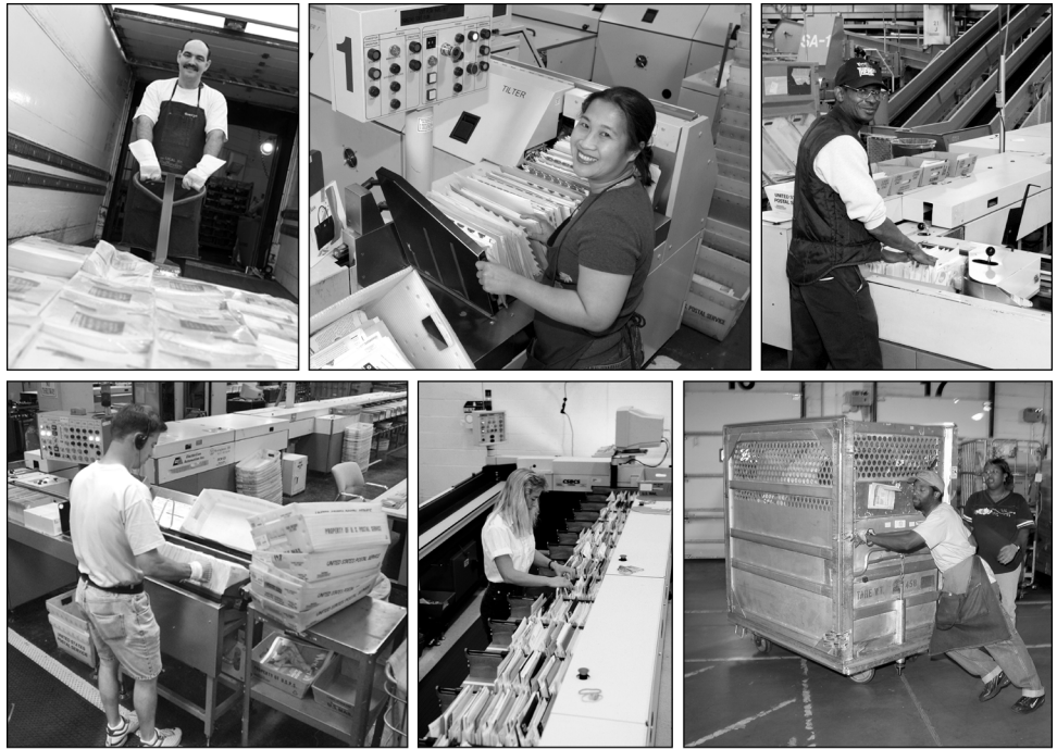
Figure 3: USPS Employees Handling and Sorting Mail in Postal Facilities