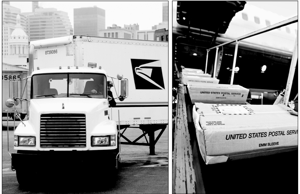
Figure 10: Long-distance Transportation of Mail Using Trucks and Airplanes