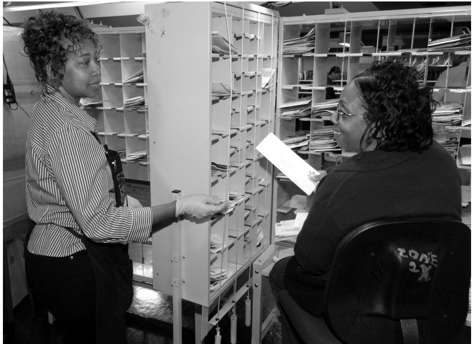
Figure 6: USPS Data Collector Gathering Ratemaking Data from a USPS Clerk Manually Sorting Mail at a Postal Facility