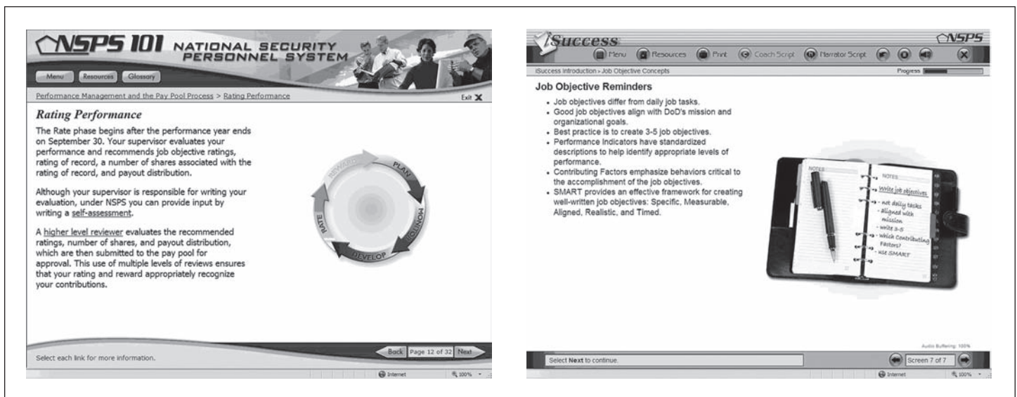
Figure 2: Sample Screen Shots from the NSPS 101 and iSuccess Training Modules

for employees converting to NSPS and sustainment training for employees already under the system. While the components are responsible for providing employees with training on the NSPS performance management system, the PEO supports their efforts by offering a variety of departmentwide training courses and other materials. For example, Web-based training modules that the PEO has developed, such as its NSPS 101 and iSuccess courses (see fig. 2 for sample screen shots), provide employees with basic knowledge about NSPS and performance management principles in general, and are used by employees to develop their job objectives. As another example, the PEO developed training guides to educate employees on changes to the NSPS classroom materials resulting from the revised NSPS regulations and implementing issuances. The PEO also developed a Web site for accessing NSPS learning materials, resources, and other tools. In addition, we found that the Air Force has begun incorporating training on NSPS as a normal part of its operations and is working to embed NSPS topics in the regular training provided to Air Force civilians and servicemembers.