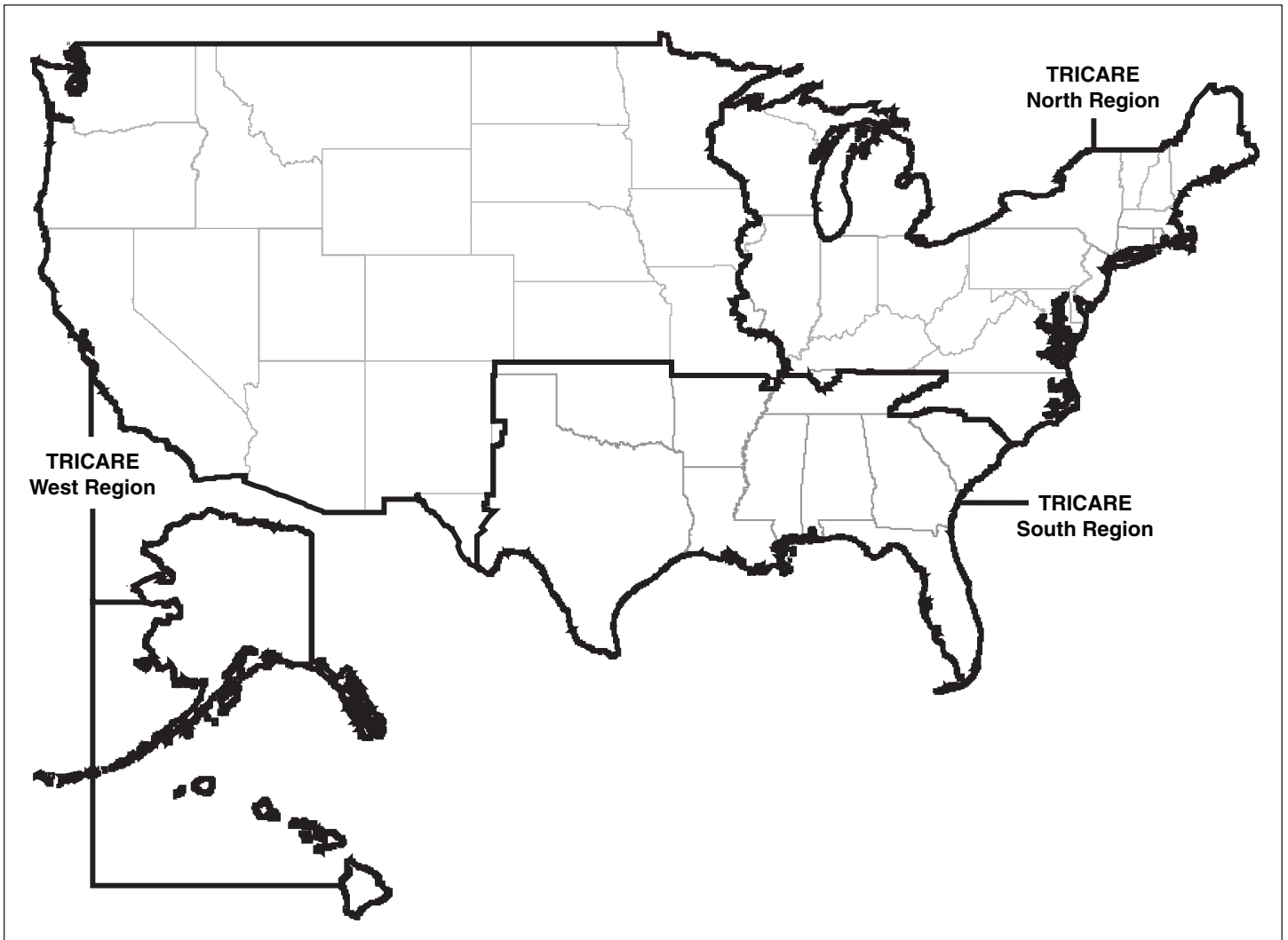
Figure 1: Location of TRICARE Regions